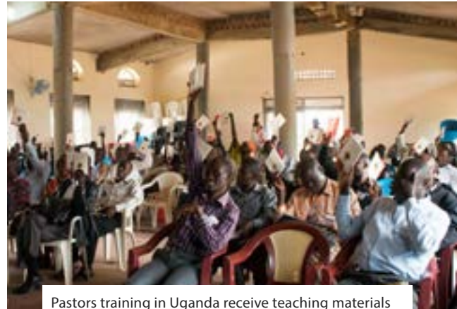
Pastors training in Uganda receive teaching materials to better equip them to pastors in their communities.

Following The Great Commission, Impacting the World