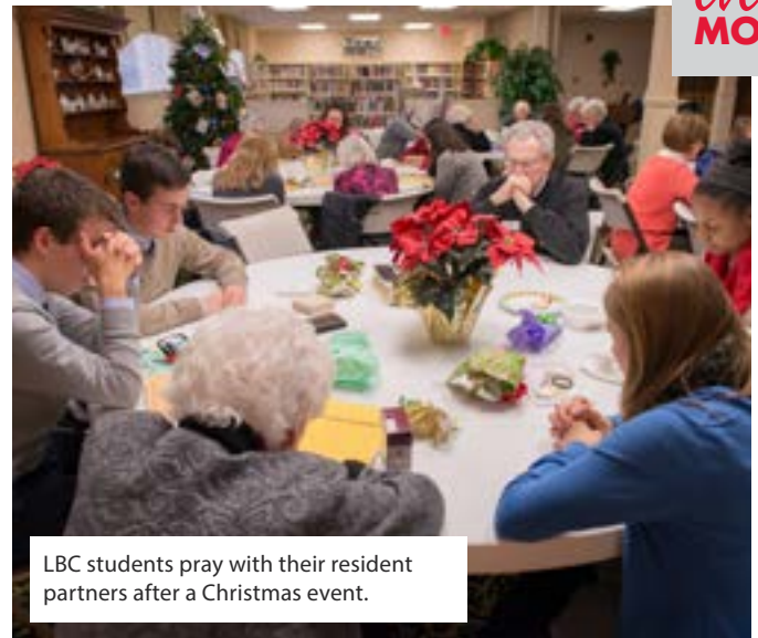
LBC students pray with their resident partners after a Christmas event.

Sometimes the education brought through relationship does not happen on campus. Sometimes service doesn't mean serving a meal or building a house. Sometimes we serve Christ best by being in relationship with those outside our normal circle. We learn to act on the love of Christ. >